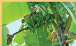
Locally Grown Food