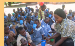
Drinks for the children